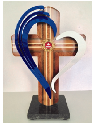
MOTHER TERESA RELIC

Blaney's Funeral Home, Radio Editions DJ and Thrivent